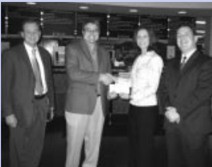
Sunflower Broadband's "Sunflower for Schools"

Lawrence is a charitable community and several organizations collaborated with the Foundation in 2005 to raise money for the Foundation and demonstrate their support for public education.