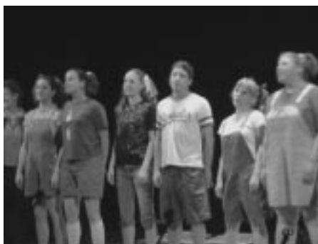
Performers at the 2005 Foundation Follies