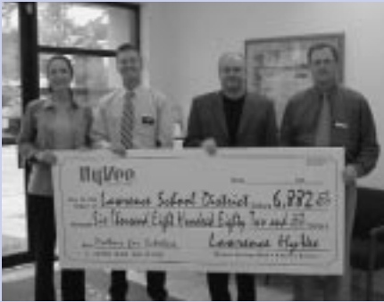
Hy-Vee's "Dollars for Scholars"