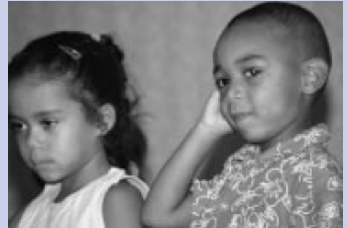
Students in the Readiness Program

The Lawrence Public Schools' Readiness Program provides a critical piece of the puzzle for early childhood education in this community. More than 108 at-risk 4-year-olds receive a full day of curriculum, meals, exercise and care at no cost to their families. Approximately one-third of this program's support, or nearly $155,000, was provided by the Lawrence Schools Foundation in 2005 through annual giving by local benefactors and private foundations.